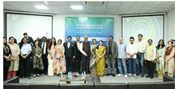
Retail Tech Summit 2024