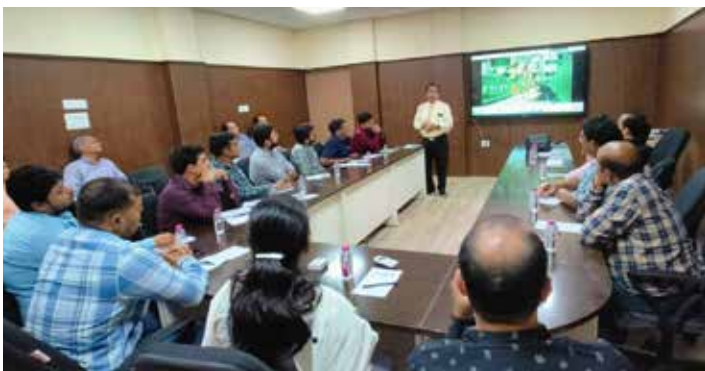
Finance for non-finance (GAIL) 24-26 July 2024