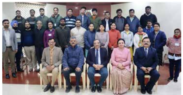
Data analytics for bankers (PSB) 26-30 December 2023