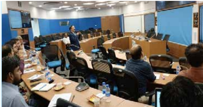
Prevention of Sexual Harassment at workplace (RITES) 27 July 2023