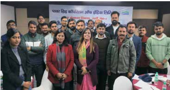
Holistic Wellbeing (KRIBHCO) 30 November - 3 December 2023