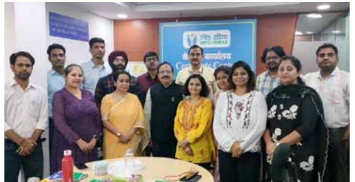
Cultivating Happiness (Grid Controller of India Ltd.) 17th-18th July 2024