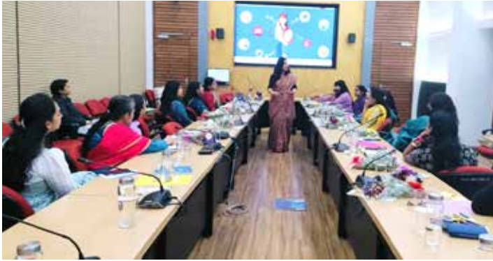
Women's day celebration (POSOCO) 8 March 2024