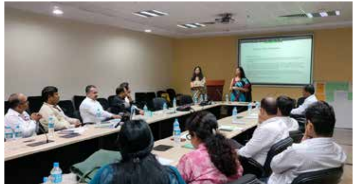
POSH (NHPC) 25-27 September 2023