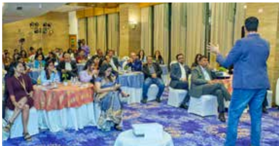
Corporate Meet & Greet