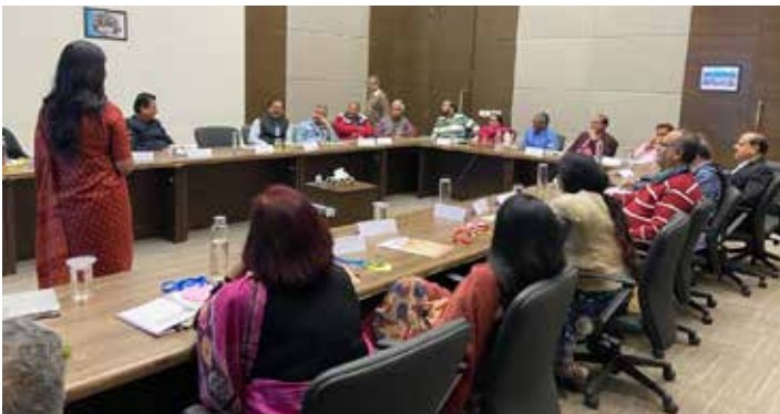
Mindful second innings (EIL) 5 December 2023