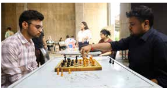
Annual Sports Meet