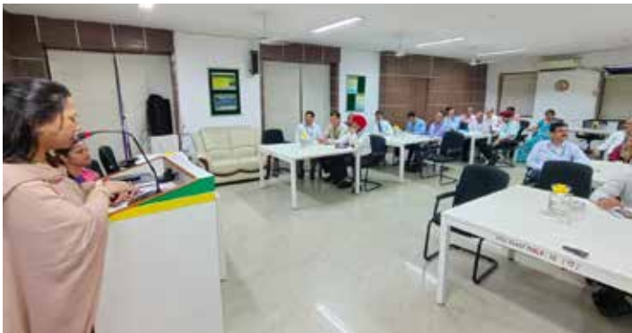
Achieve and excel- motivational program (PSB) 15-16 July 2024