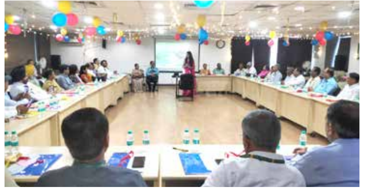
Connection of mind, body & spirit through fun & enjoyment (PSB) 25 April 2024