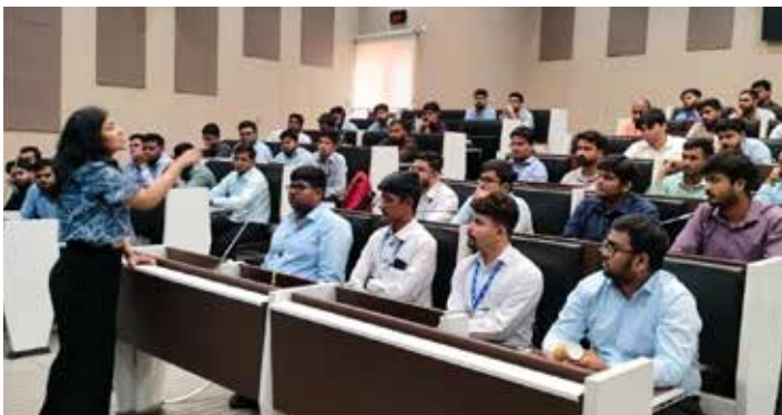
Business etiquettes and team building (NTPC) 6 May 2024